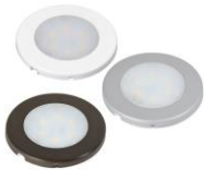
Interchangable Bezels for RZ-SM RD