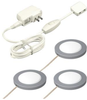
KIT-RZ-SM RD3 (Round 3 Module Kit)