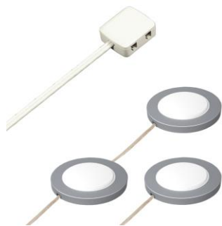
KIT-RZ-EXT SM RD3 (Round 3 Module Extension Kit)