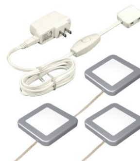
KIT-RZ-SM SQ3 (Square 3 Module Kit)