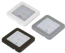
Interchangable Bezels for RZ-SM SQ