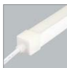
DL-FLEX2-LNDBSL-TS-PC-HW Tail-Side Connector with Hardwire Leads