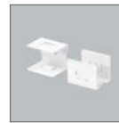
DL-FLEX2-LNDBSL-BR Metal Mounting Bracket