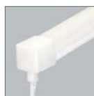
DL-FLEX2-LNDBSL-US-PC-HW Universal Side Connector with Hardwire Leads