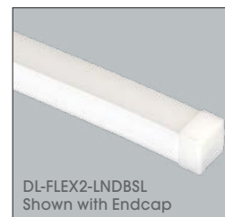
DL-FLEX2-LNDBSL Shown with Endcap