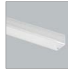
DL-FLEX2-LNDBSL-CH3 3' Metal Mounting Channel