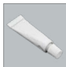
SEALANT Seal endcap to product post field shortening